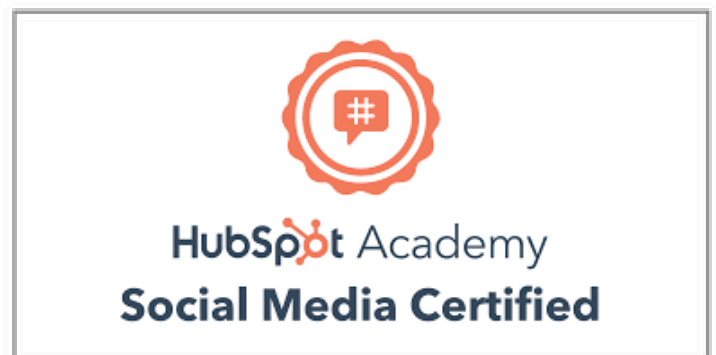
Hubspot Social Media Marketing