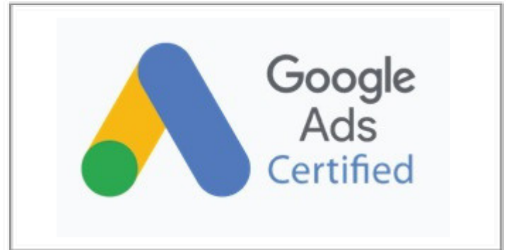
Google Ads – 8 Certificate