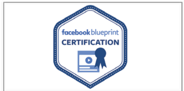
Facebook blueprint Certificate