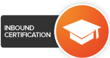
Hubspot Inbound certificate